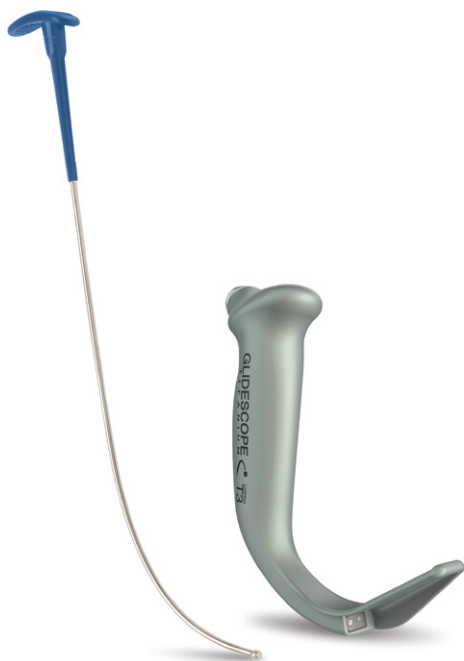
Figure 1. GlideRite Rigid Stylet and GlideScope Titanium Reusable Video Laryngoscope

The GlideRite Rigid Stylet is specifically designed to work with GlideScope video laryngoscopes. The angle of the GlideRite Rigid Stylet complements the unique angle of the GlideScope instrument to help facilitate quick placement of an endotracheal tube and to help reduce patient trauma.